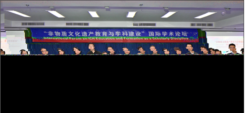
Figure 1. Group Photo of Some In-Person Participants at the International Forum. December 5, 2020. 2

curricula, and the reality of who gets to be a student or professor. Building on adopted by the United Nations (UN) in 2015, Bamo Qubumo, a folklorist at the Chinese Academy of Social Sciences, focused on the cross-cutting concerns between the UN sustainable development goals and the transmission of, and education about, ICH. Bamo stressed as well the further linking of heritage education with UNESCO's recent documents related to the international cooperation mechanism for ICH safeguarding, so as to promote the discussion of the possible approaches to ICH safeguarding in the field of cross-sectoral policymaking.